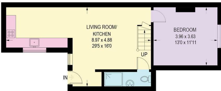
FIRST FLOOR = 48.9 SQ M / 526 SQ FT

APPROXIMATE GROSS INTERNAL AREA = 80.9 SQ M / 870 SQ FT